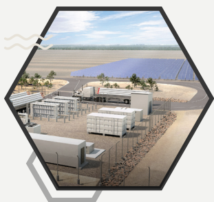
Image: Artist's impression of Kogan renewable hydrogen demonstration project.

On 25 March, Energy Ministers signed a Memorandum of Understanding for the refuelling corridors starting with the Pacific Highway, Hume Highway and Newell Highway.