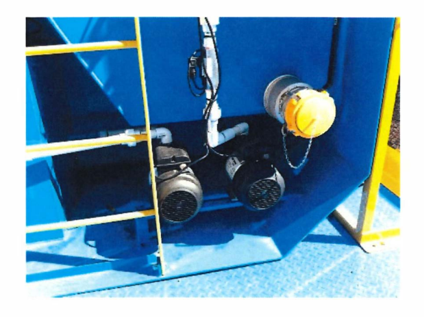
One of these NOV Mono pumps pressurize final waste through the filter and onto the UV filter before irrigating onto the ground while the other returns sludge back into the system to allow another process step