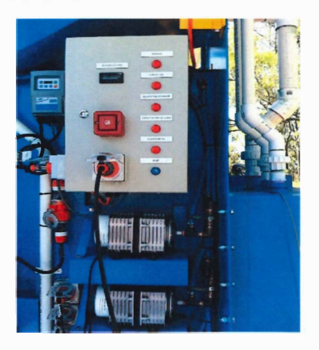
PLC—Programmable Logic Controller fully automates the unit for easy operation. Audible alarms are in place to manage malfunctions with troubleshooting backup