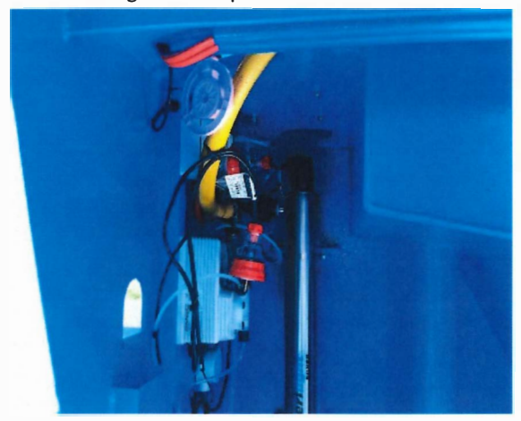
Chlorinator automatically doses chlorine through flow rate to the required amount

Viking Grease Trap takes away all the fat from the kitchen before entering the main process