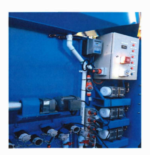
Individual Air Pumps operate in each tank, providing regulated air through the Dissolved Oxygen Metre. The Oxygen metre is heat compensated