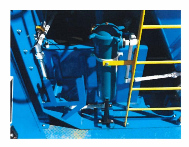
Filter Housing Assembly carries a 50 micron filter bag that is easily changed out when necessary