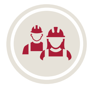
Approx 3,172 apprentice and trainee full-time equivalents